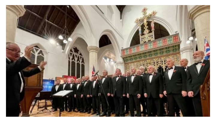
Cwmdare Voices with Pelenna at the Armistice