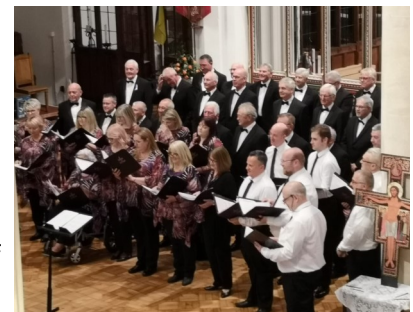
YMA O HYD WITH CON VOCE

YMA O HYD A few years ago the Choir travelled to Stoneleigh, a village near Coventry to perform at a concert with their male voice choir. It was such a success that we invited them down to our own neck of the woods for a return match. Billed as the Festival of Voices on the 8th October we played host to not only Stoneleigh Male Voice Choir but also to Con Voce, a local mixed choir, and what a night it was! Filling St Elvans Church, the three choirs took turns to entertain the audience and what a successful evening it turned out to be. Lots of encouraging audience plaudits and positive feedback, everyone seemed to enjoy it. One of