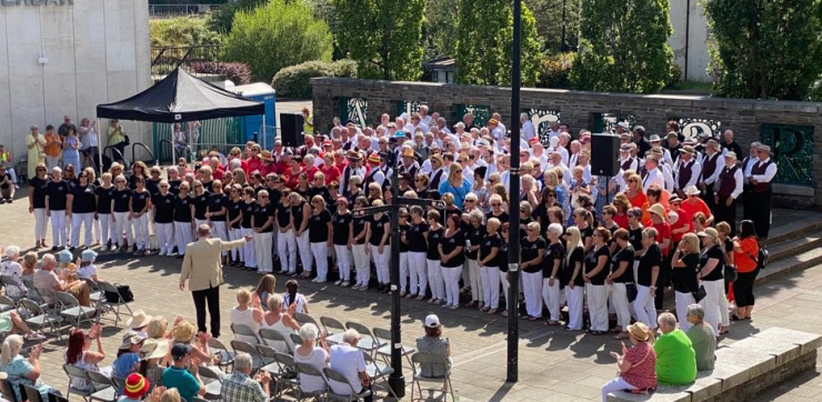
The Welsh Proms at St. David's Hall, Cardiff