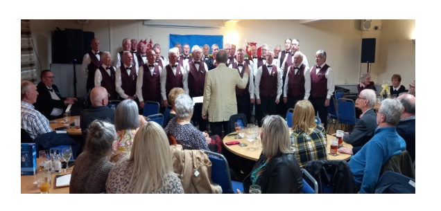
A great night at the Aberdare Rugby Club

Just to round it all off we had another fund raiser for Ukraine,