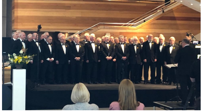
Again, the Choir with Pelenna at the Millennium Centre Cardiff at a Saint David's day concert