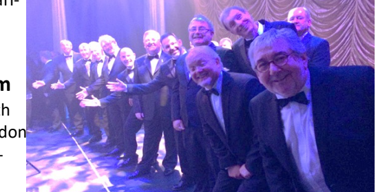
Waiting for the curtain to rise at the Coliseum

Cwmdare Voices opened the first and second halves and also took part in the finale to a standing ovation.