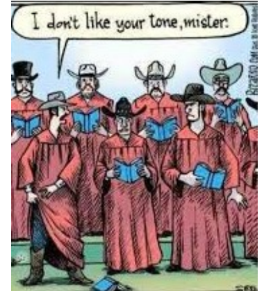
SHOOT-OUT AT THE OK CHORAL