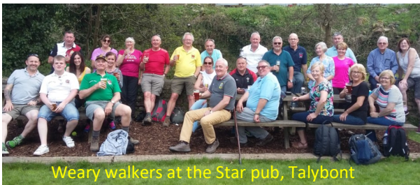
Weary walkers at the Star pub, Talybont

The choir has always supported charitable events and we've also, each year identified a local charity for which we've collected. In April we undertook, together with several of our family members and friends, a sponsored walk for Rowentree Cancer Care charity along the Brecon Canal to Talybont where most of us spent a pleasant afternoon in the sunshine entertaining the pub's clients with songs while others needed a long lay down and a massage to get their old legs back in working order