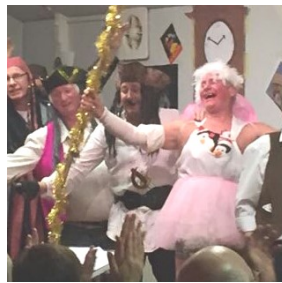
Fairy Nuff hamming it up