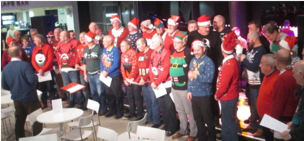
A fine display of Christmas jumpers at Royal Welsh College of Music & Drama

Lots to look back on and even more to look forward to for the year to come, however, lets start at last Christmas. If one recalls we had an invitation from the Royal Welsh College of Music & Drama to perform together with the boys from Pelenna in the college's foyer. It was a Christmas jumper fest with everyone joining in the festive songs with a couple of cheap pints in the student bar afterwards. In the run up to the big day we performed in Tesco's and the Aberdare Market and also held a memorable concert in Nebo Chapel, again with the superb children's choir from Cwmndare primary School.