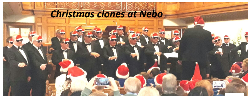
Christmas clones at Nebo

Later in the month we were invited to take part in our first official wedding ceremony in Tenby and after the official songs were completed a fine afternoon and evening was spent sampling the local ales and entertaining pub customers with our songs.